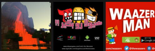
Minecraft Wallpaper Catch The Monster. Waazerman - Traile